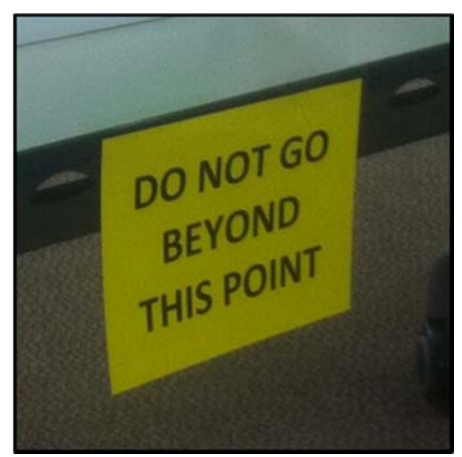
Figure 15. 'Do Not Go Beyond This Point' sign