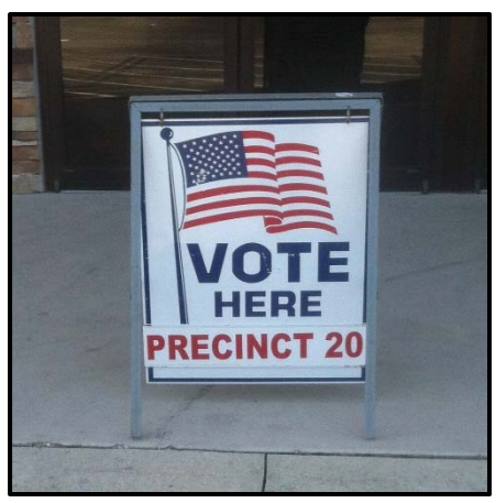
Figure 12. Precinct location sign

1. Precinct locations were adequately marked and identified as a voting location [Figures 12-13].