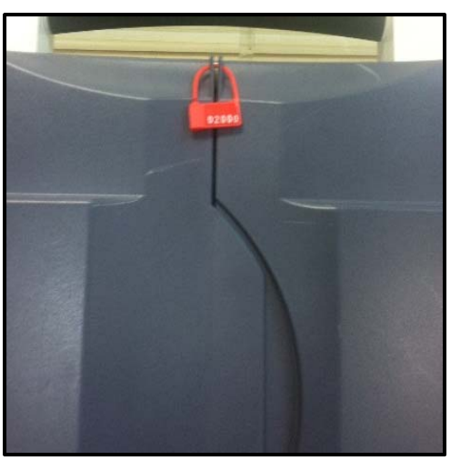
Figure 11. Sealed TSx DRE - ADA Device