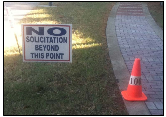
Figure 8. Campaigning boundary sign/cone at early voting site

The 100-foot campaigning boundary was clearly marked in all locations [Figure 8]. If campaigners were present, they were appropriately stationed outside of the boundary.<sup>4</sup>