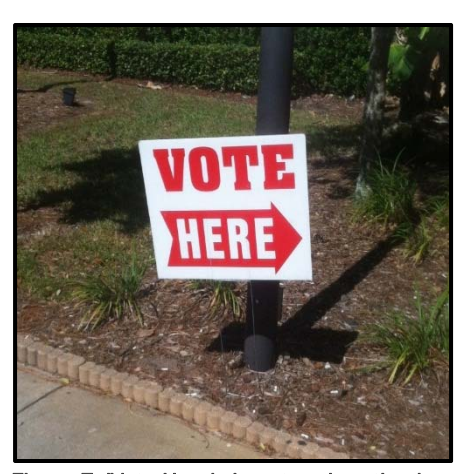
Figure 7. 'Vote Here' sign at early voting location