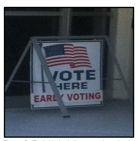
Figure 6. 'Early Voting' sign at early voting location

1. Early voting sites were adequately marked and identified as a voting location <sup>3</sup> [Figures 6-7]. It would have been helpful, however, to have had the polling site's actual room entrances and exits more clearly marked as several voters were confused about which of the doors was the entrance and which was the exit.