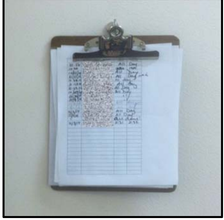
Figure 14. Vault 'sign in/out' log