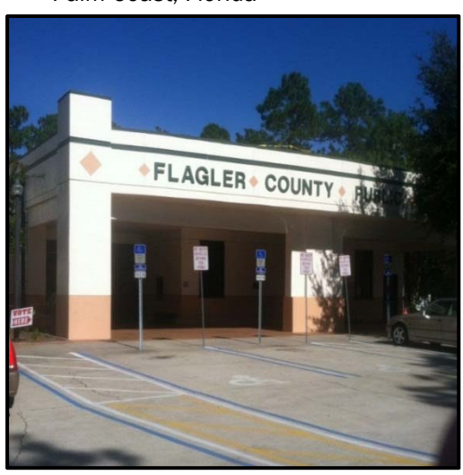
Figure 4. Flagler County Public Library early voting site

Flagler County Public Library 2500 Palm Coast Parkway, NW Palm Coast, Florida