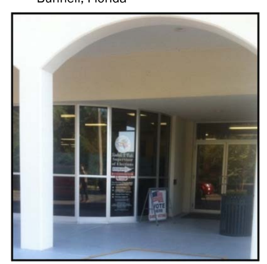
Figure 5. Flagler County Supervisor of Elections early voting site

3. Flagler County Supervisor of Elections Office 1769 E. Moody Boulevard Bunnell, Florida