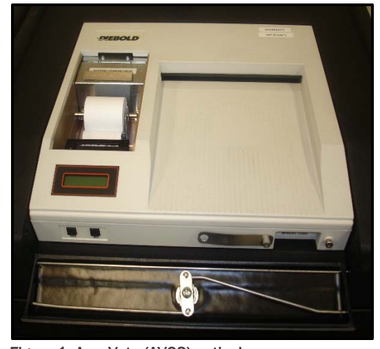
Figure 1. AccuVote (AVOS) optical scanner

Flagler County uses the Dominion Voting System–GEMS, Release 1.21.6, Version 1, voting system. Voters cast their ballots on either the AccuVote OS (AVOS) optical scanner [Figure 1] or the AccuVote TSx (TSx) direct recording electronic device [Figure 2]. The AVOS machine scans and tabulates marksense paper ballots and has been in use in Flagler since the year 2000. The county's accessible voting equipment is the TSx. This is a "touchscreen" device that functions by recording, casting, and tabulating voter choices." The county has used the TSx since 2006.