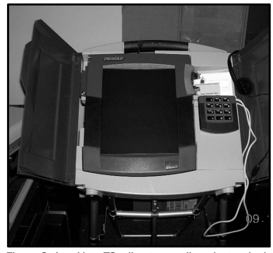
Figure 2. AccuVote TSx direct recording electronic device