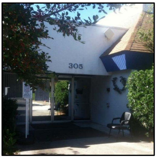
Figure 3. Palm Coast Community Center early voting site

Palm Coast Community Center 305 Palm Coast Parkway, NE Palm Coast, Florida