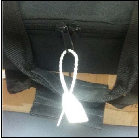
Figure 10. Sealed AVOS tabulator