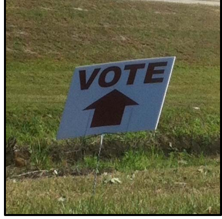
Figure 13. 'Vote' sign indicating early voting location ahead